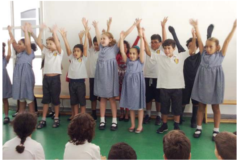
Year 4 and Year 5 teaching everyone a new song in Assembly