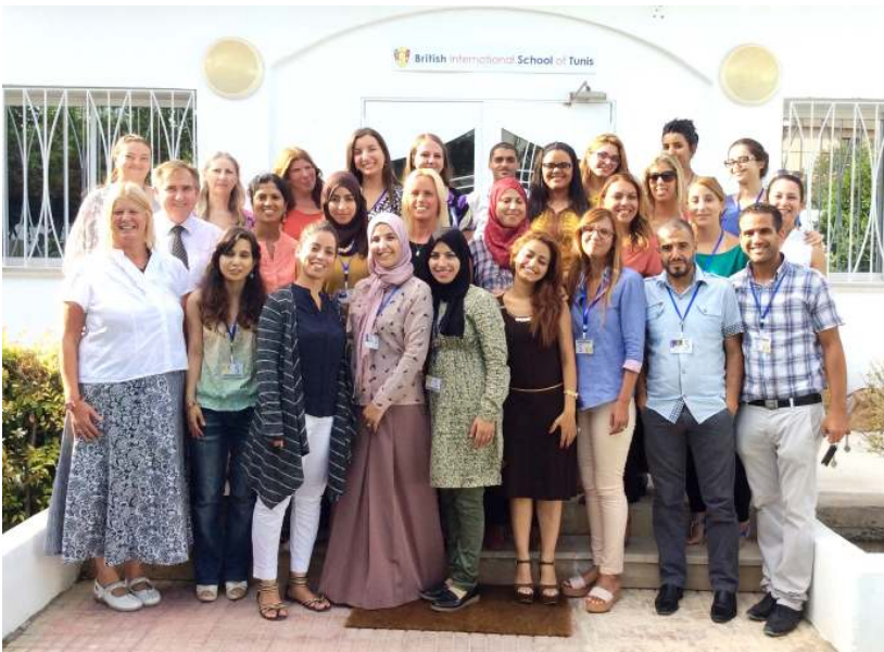
BIST Team 2015

school would stay open. However, one telephone call from an investor made me realise that we would continue, come what may; the caller simply wanted to know which day school started on in September! So whilst it has been a huge struggle to find staff that will ignore travel advice, it is now possible to say that all our teaching positions have been filled with a distinctly international flavour, and an extraordinary array of talent, yet all with the shared joy of teaching the English language.